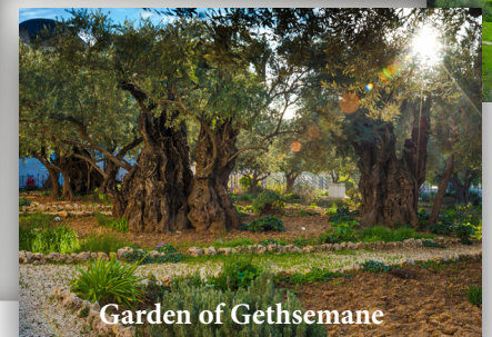
Garden of Gethsemane