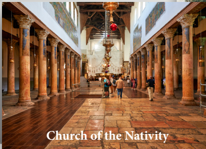
Church of the Nativity