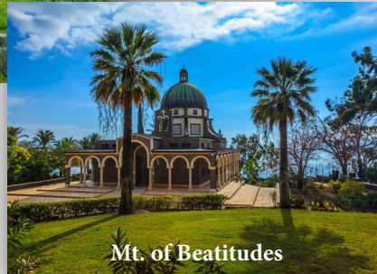
Mt. of Beatitudes