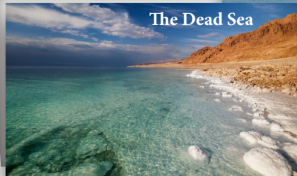
The Dead Sea